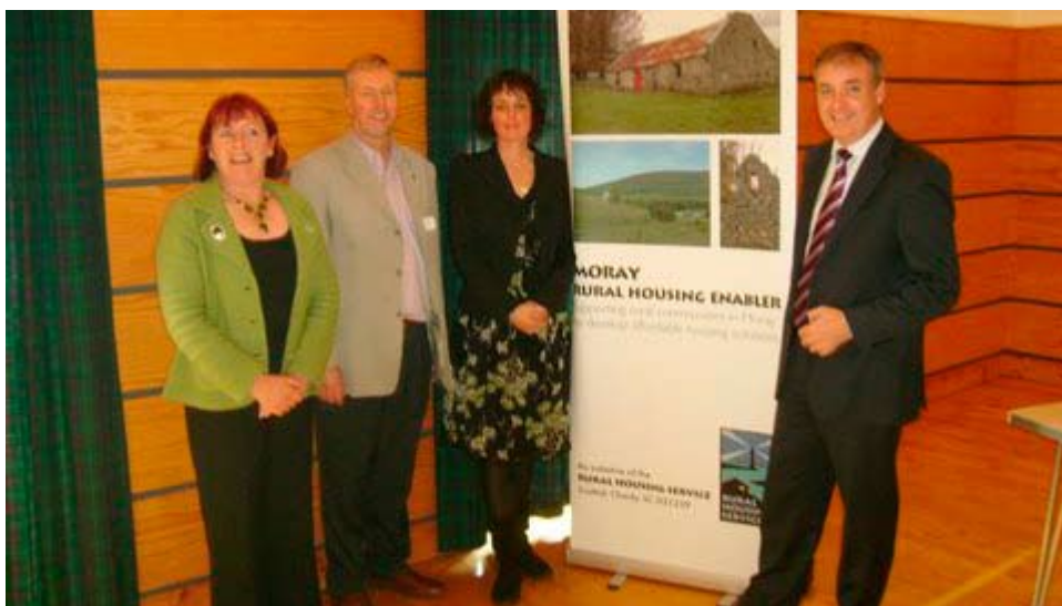
Cabinet Secretary, Richard Lochhead, launches the Moray Rural Housing Enabler project

The result is that we do not know accurately what the demand is, what sort of housing is needed and in which of our rural communities. This is the information the Rural Housing Enabler has been tasked to uncover.